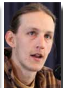
White: Northside Food Co-op grant