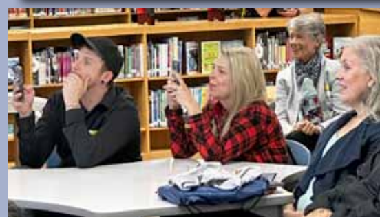
Proud parents and family members at Oct. 18 ceremony.