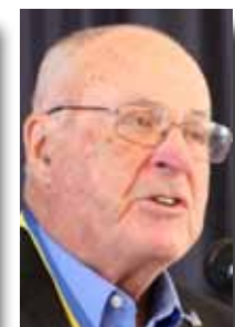
Smith: Theatre for All arts grant