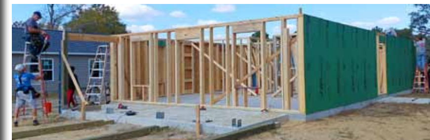
The house near the end of the first build day Oct 28. Roofing—trusses and deck—and vinyl siding were installed on two work days in November.