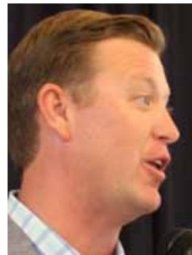
Pyron: business recruiting