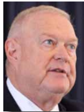
Warner: Veterans Day