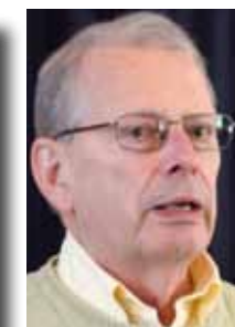
Sackett: 2Share furniture grant