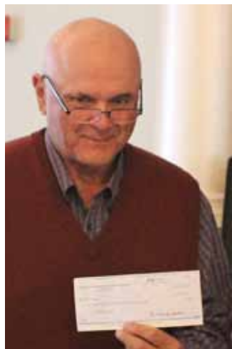
First order of business: the money