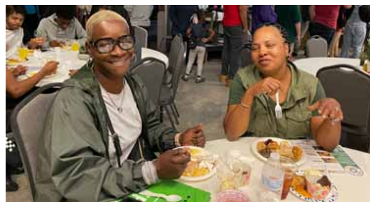
Two of the hundreds of guests at Nov. 17 Northside Community Dinner.