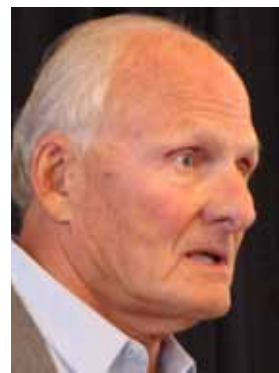
Patulski: football career